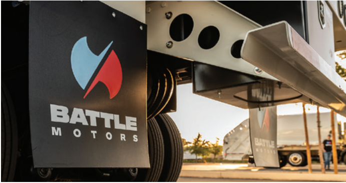
Cast steel, tubular crossmembers provide consistent strength fore and aft, side-to-side