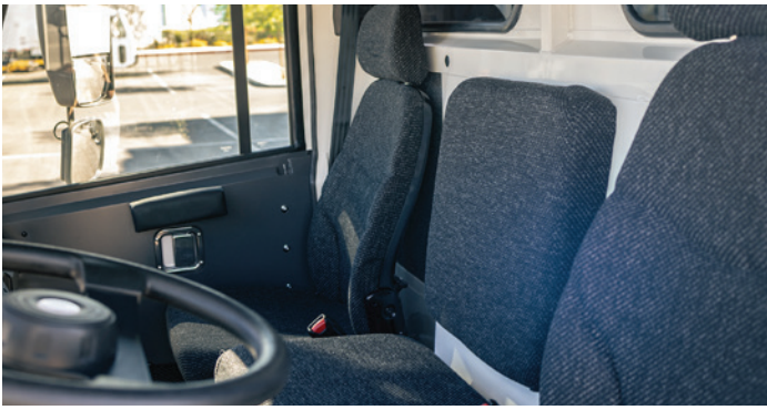
Seating for three all forward facing with seat belts