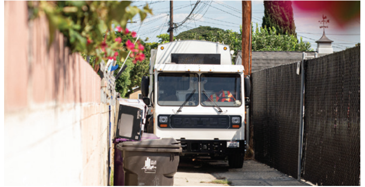
82" cab width engineered to be 12" narrower than our standard chassis for tight applications