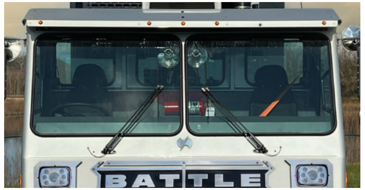
Large, flat, glass windshield; simple to replace and cost effective compared to complex, curved glass