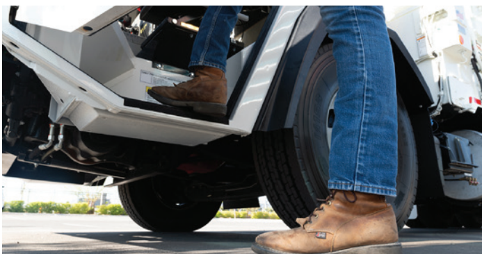
True low entry 18" step-in height on both sides

The Battle Motors LNT is ideal for pick-up, delivery and general transport challenges posed by dense city environments. Strategically designed at 12" narrower than our standard work truck chassis, the LNT expertly maneuvers tight side streets and alleyways; navigating access and service roads with ease.